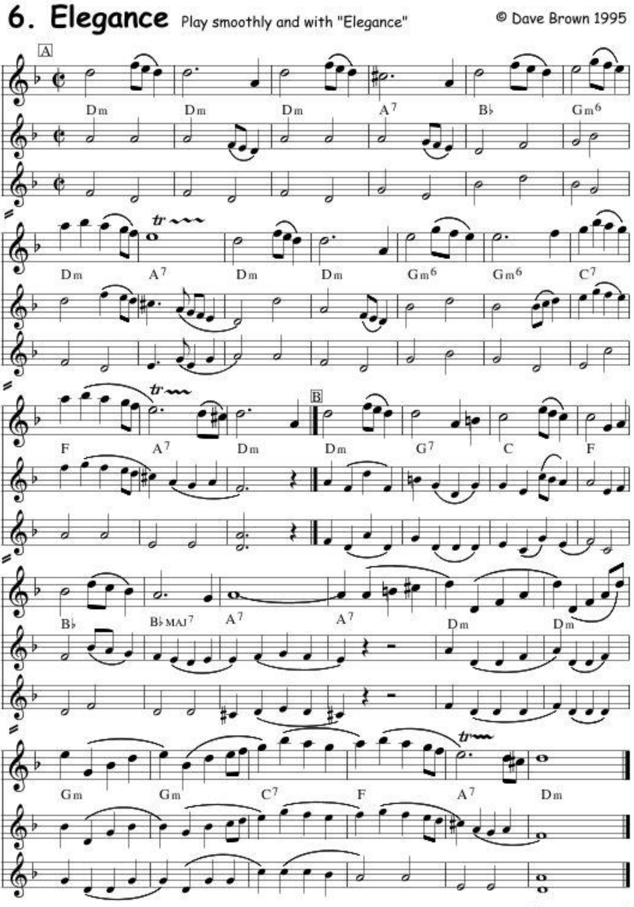
Page 10 www.dlbmusic.org.uk