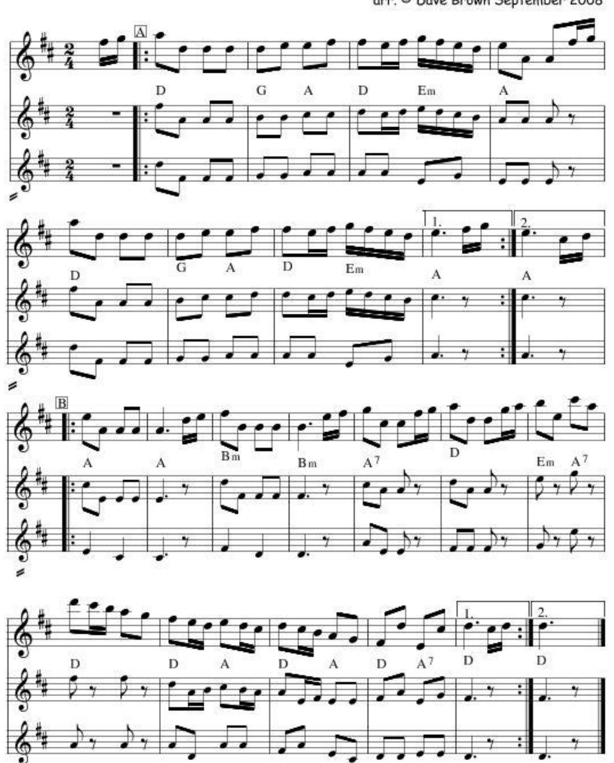
Walsh 1745 arr. © Dave Brown September 2008